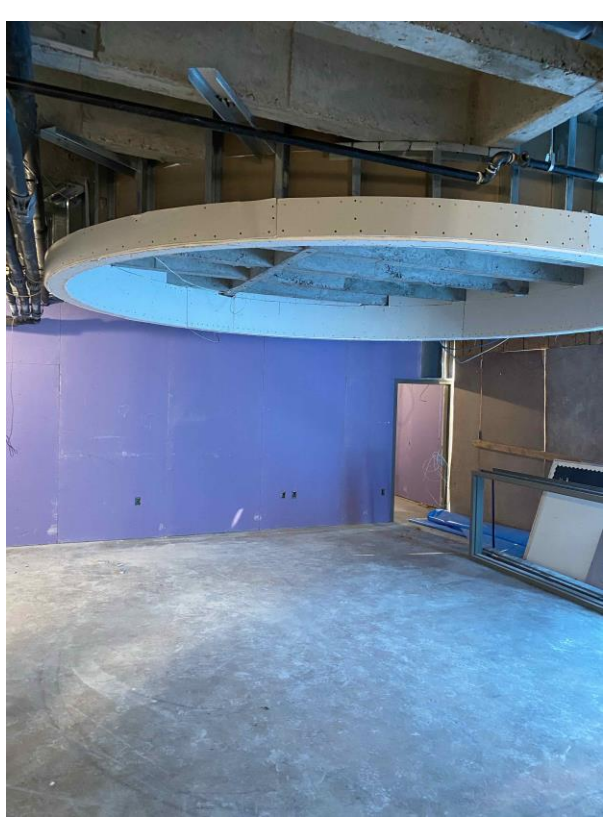
Cloud ceiling soffit